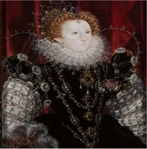
Figure 6 Nicholas Hilliard, Queen Elizabeth I 'The Rothschild Portrait' , 1576–1578, oil on panel, 81.5 × 61.2 cm. Collection of Waddesdon (Acc no: 27.2017).