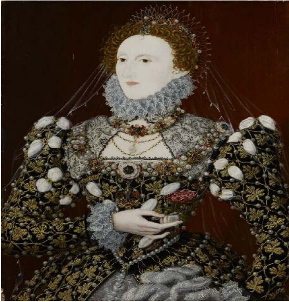
Figure 5 Associated with Nicholas Hilliard and workshop, Queen Elizabeth I 'The Phoenix Portrait' , circa 1575, oil on panel, 78.7 × 61 cm. Collection of National Portrait Gallery, London (NPG 190).